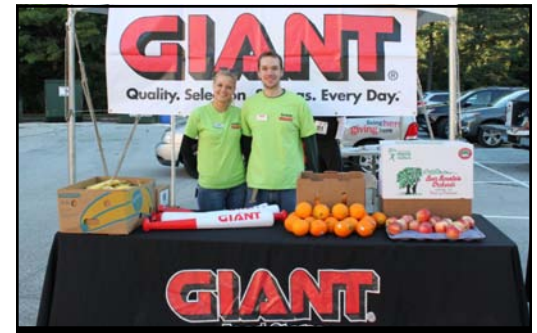
GIANT FOODSTORES WAS THE TITLE SPONSOR OF THE RUN AND PROVIDED FOOD FOR ALL OF THE RUNNERS AFTER THE RACE