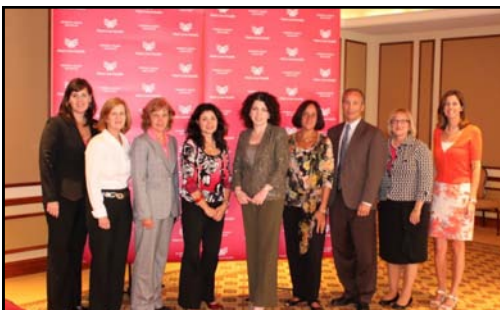
MAIN LINE HEALTH CARDIOLOGISTS, NURSES AND PHYSICIANS ASSISTANTS SPOKE TO ALL OF THE ATTENDEES ABOUT HEART HEALTH AND KNOWING YOUR NUMBERS