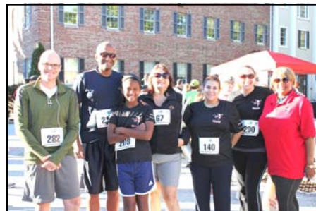
TEAM WELLS FARGO