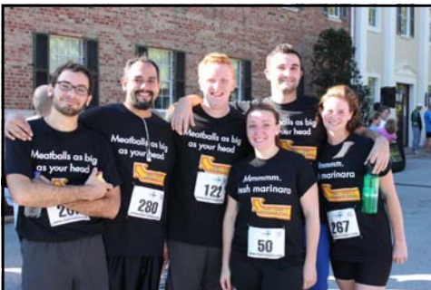
TEAM BUCA DI BEPPO—WYNNEWOOD

JOSEPH P. MELVIN COMPANY, P.C. CPAs & Advisors